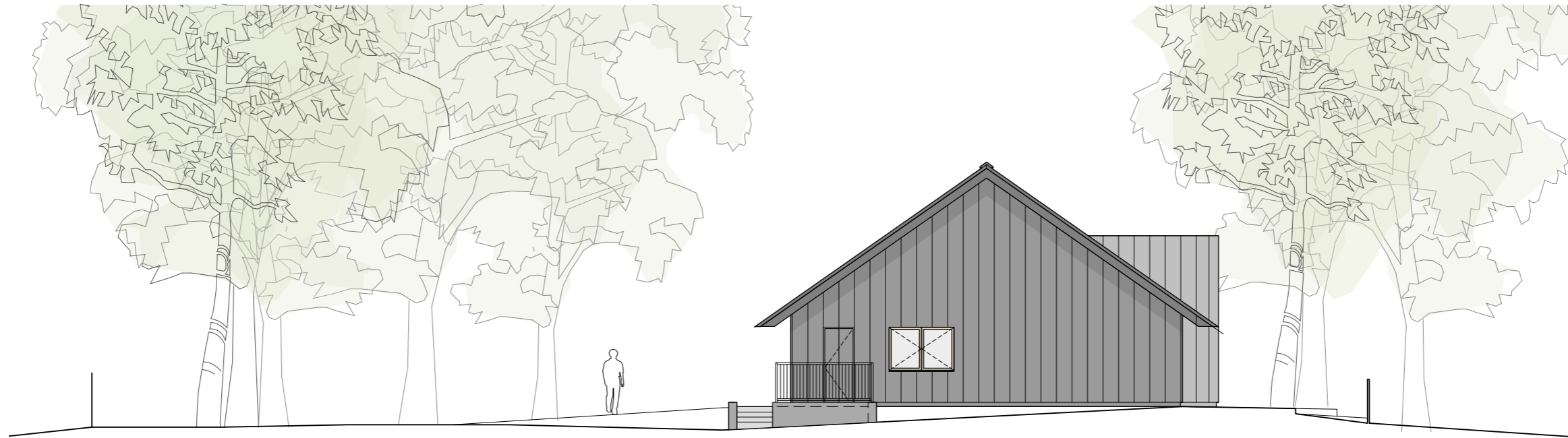
Proposed North West Elevation to Car Park