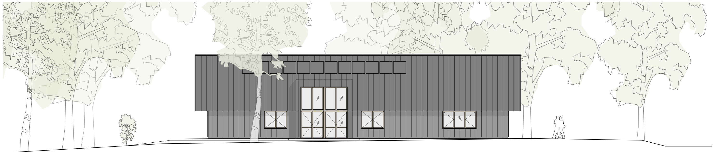
Proposed South West Elevation to Churchyard