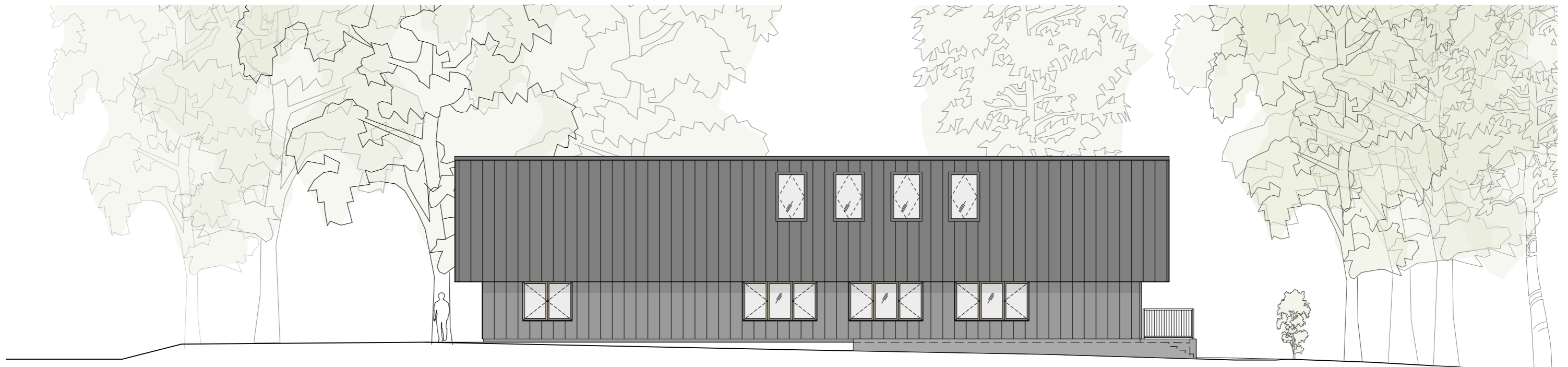
Proposed North East Elevation to Car Park