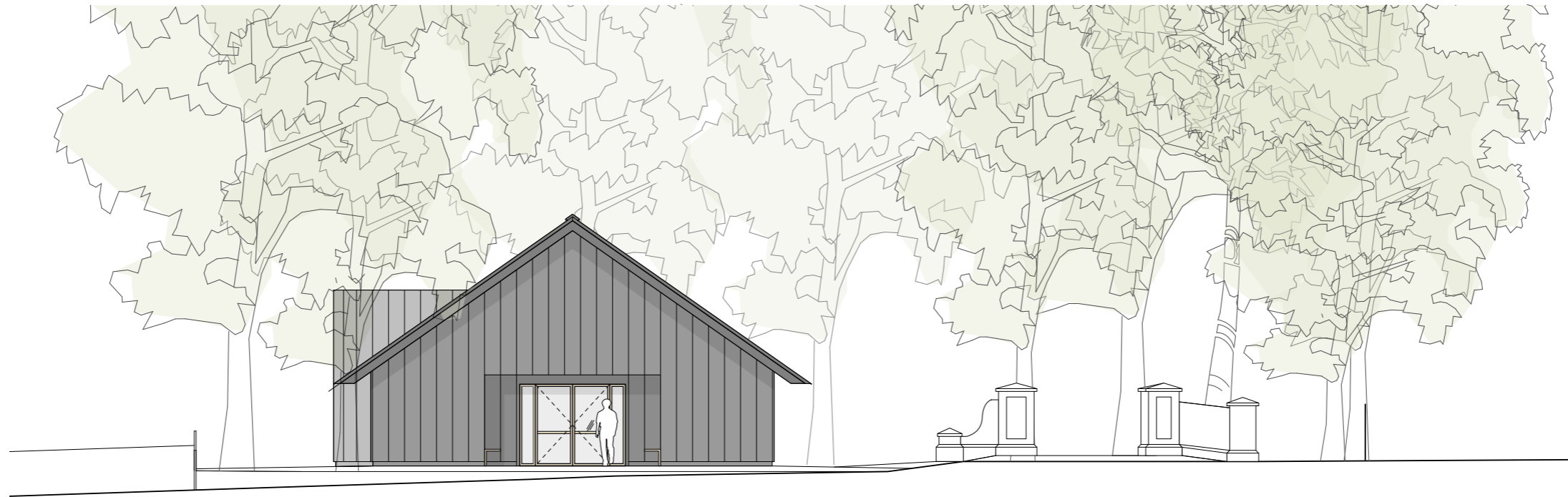
Proposed South East Elevation to Church Street